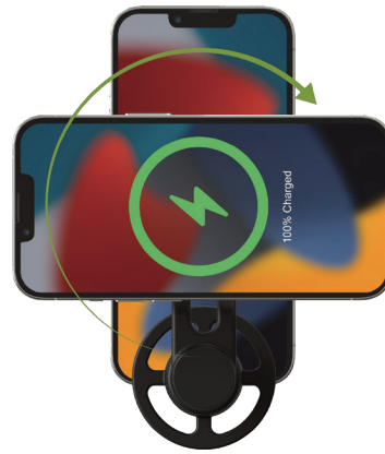
LANDSCAPE AND PORTRAIT MODES